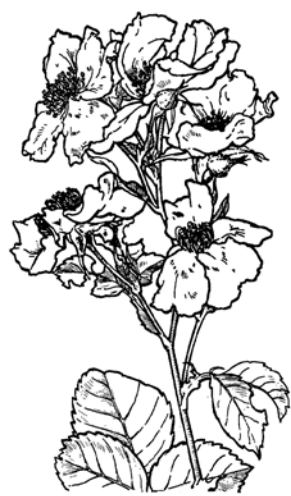
Dog Rose flowers are common in the hedges in spring, and are followed by red hips in the autumn

The path then bears to the left, towards Hill Farm, which you enter through the gate. Walk through the farmyard and down the farm track to Appleby Hill, enjoying the views of Warwickshire and Staffordshire in front of you. Turn right and continue up the hill.