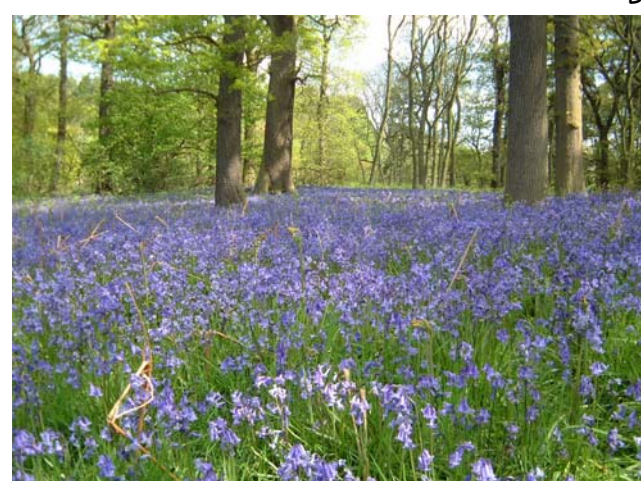
Bluebells in Merevale Woods

Turn right and walk carefully along the road until you reach the entrance to Hoar Park. Turn right and walk down the access road to the Craft Centre (E). To continue the walk, follow III.