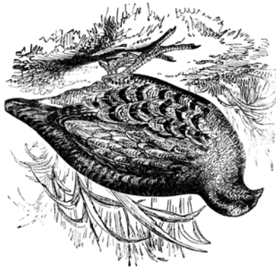
Partridge, commonly found on arable fields in groups of 6-15, commonly know as coveys. They are slowly making a comeback after being in decline for a number of years. They make a sound like "skeeer-ick" when calling, and have a whirring type of flight, followed by a long glide.