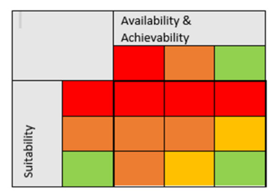
Figure 1: Example of a site assessment matrix (illustrative: each LPA would develop its own methodology for this level of detail)

3.8 To summarise: this document has been prepared jointly to ensure a consistent shared approach to identifying and assessing sites for housing and employment uses, which will be used by each Local Authority (or alliance of Local Authorities where shared plans are developed) as the framework within which they will develop their detailed assessment and selection processes.