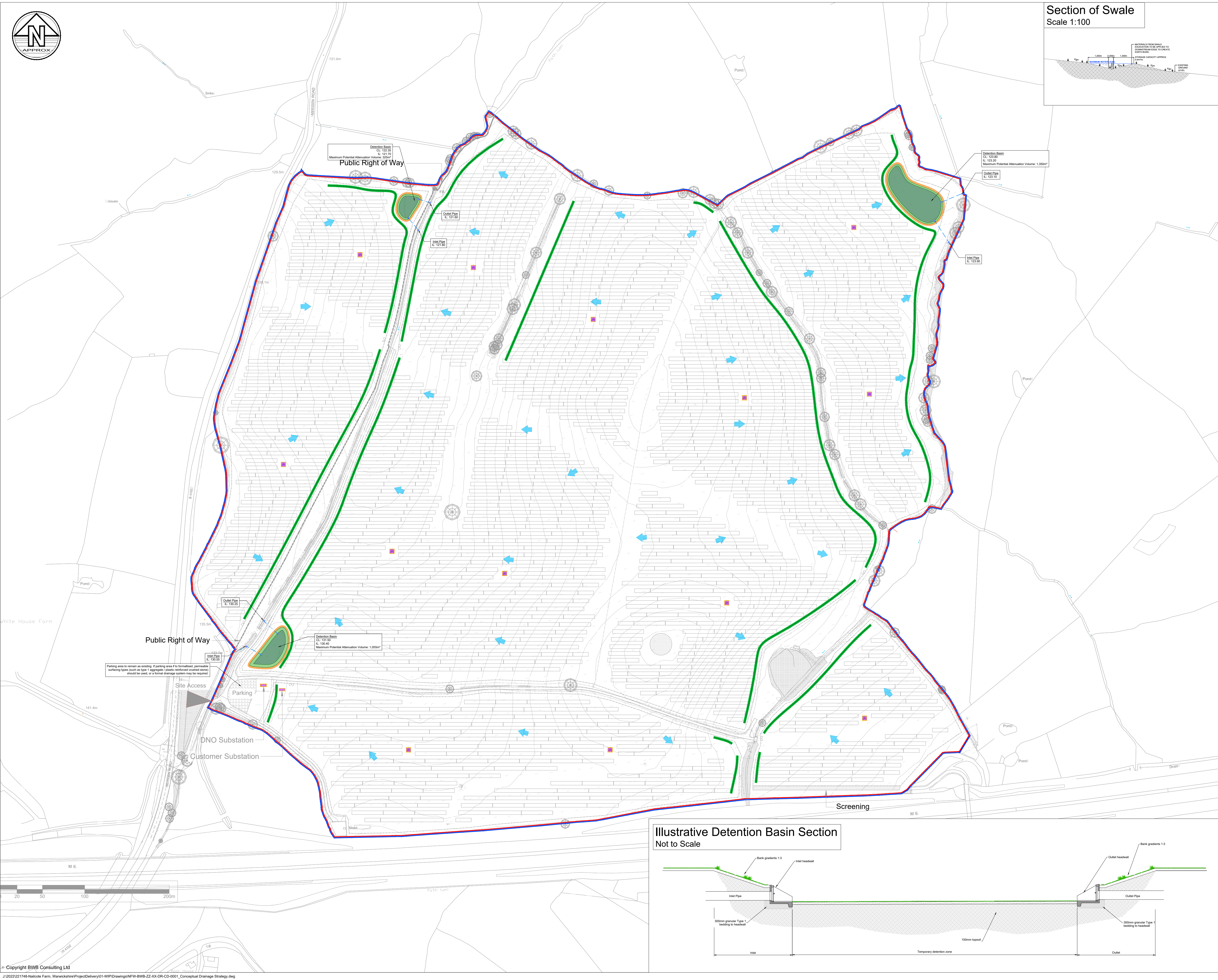
Section of Swale Scale 1:100