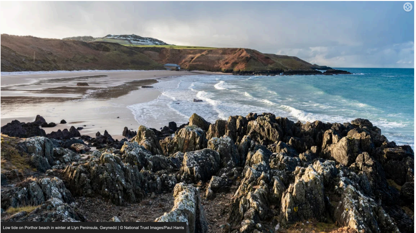
Low tide on Porthor beach in winter at Llyn Peninsula, Gwynedd